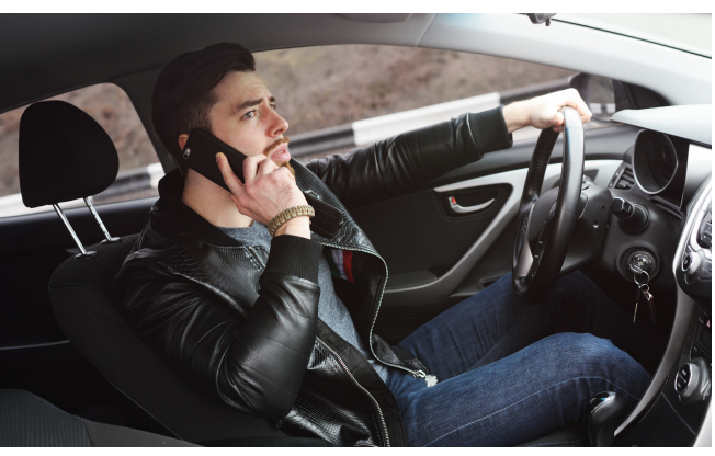
Using the cell phone while driving